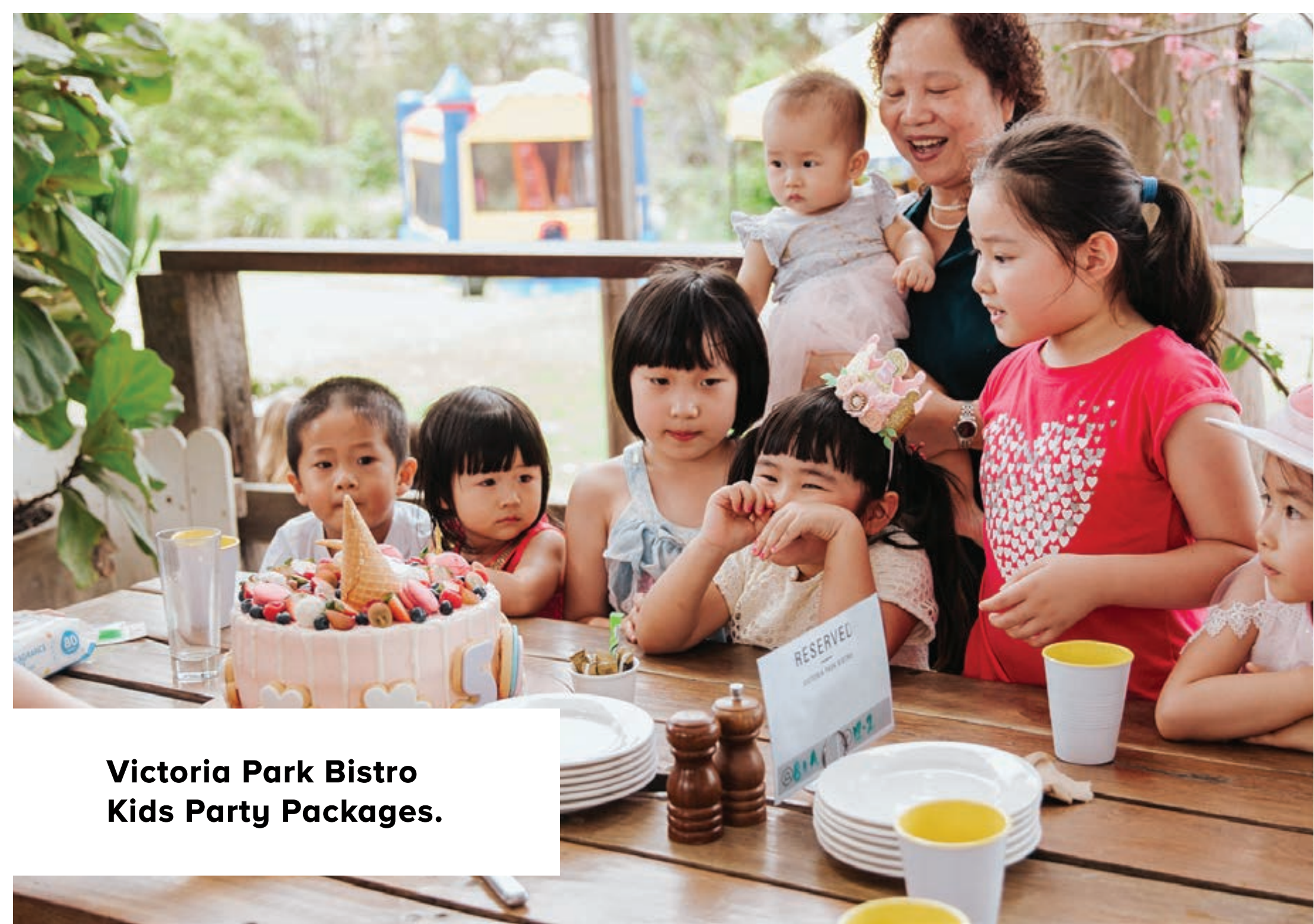
Victoria Park Bistro Kids Party Packages.